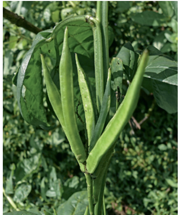
The guar bean

With TopBake WA Plus and TopBake WA Pure the flours absorbed as much as 10% more water than the untreated control. Moreover, besides a nearly 8% higher water absorption the farinogram showed the flour treated with TopBake WA to have very good stability (Fig. 1).