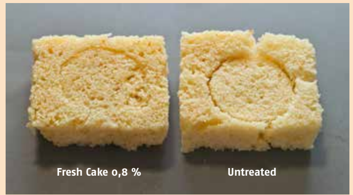
Fig. 2: Effect on the crumb structure of Madeira cake

Fig. 2 shows the difference in the hardness of the crumb. Whereas the product treated with TopSweet Fresh Cake Plus V is elastic, the dry crumb of the other cakes breaks when tested with the Texture Analyser.